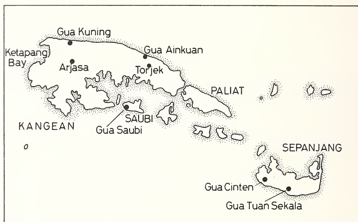
The position of the Kangean Islands (above) and the position of the bat collecting localities on Kangean, Saubi and Sepanjang (below)